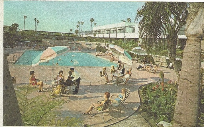
SWIM OR SUN BY THE HEATED OLYMPIC POOL