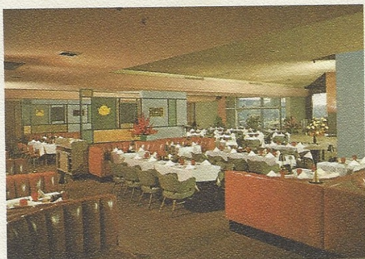
ENJOY GOURMET DINING OR ANYTIME SNACKS