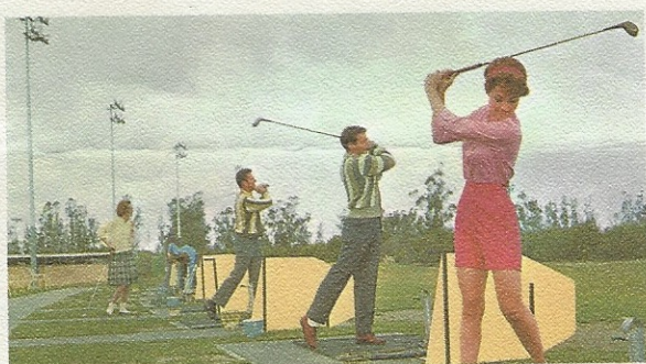
50-TEE DRIVING RANGE