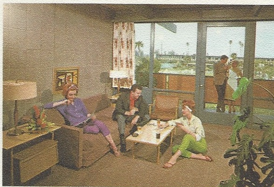
AIRCONDITIONED SUITES HAVE PRIVATE SUNDECKS