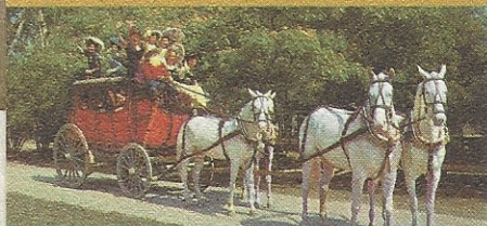
VISIT KNOTT'S BERRY FARM!