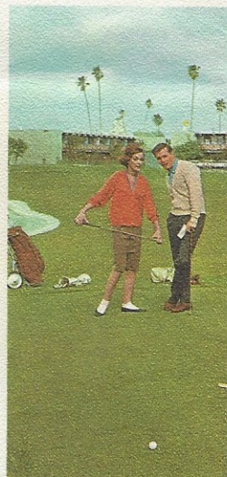
LIGHTED 40-ACRE 18-HOLE F