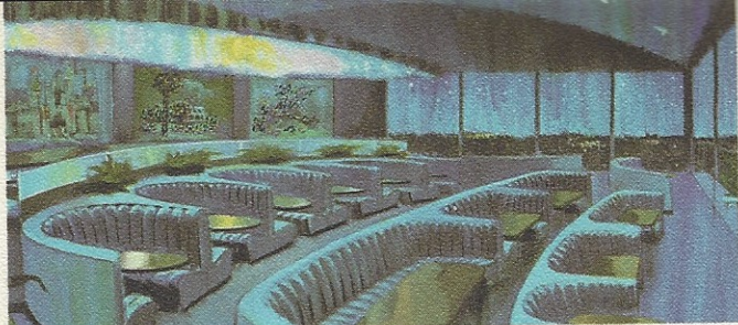
TOP-OF-THE-PARK IS TOPS