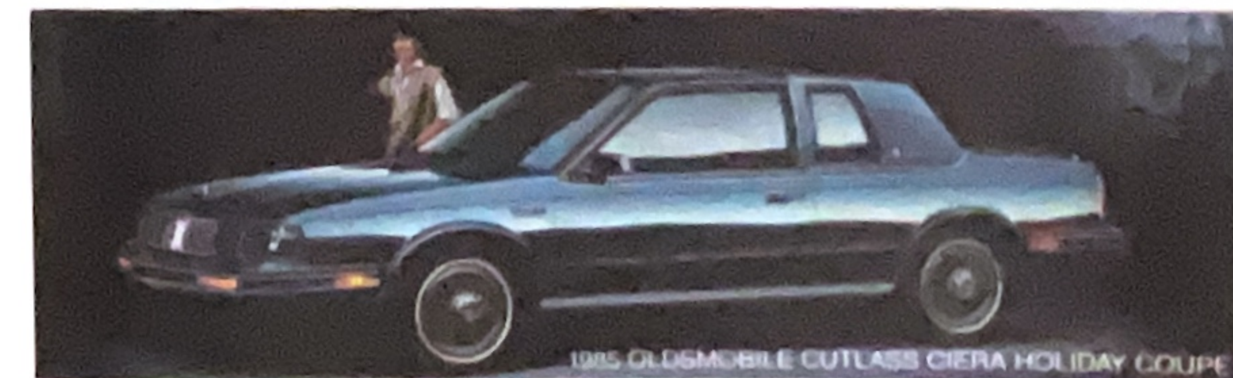
1985 OLDSMOBILE CUTLASS CIERA HOLIDAY COUPE