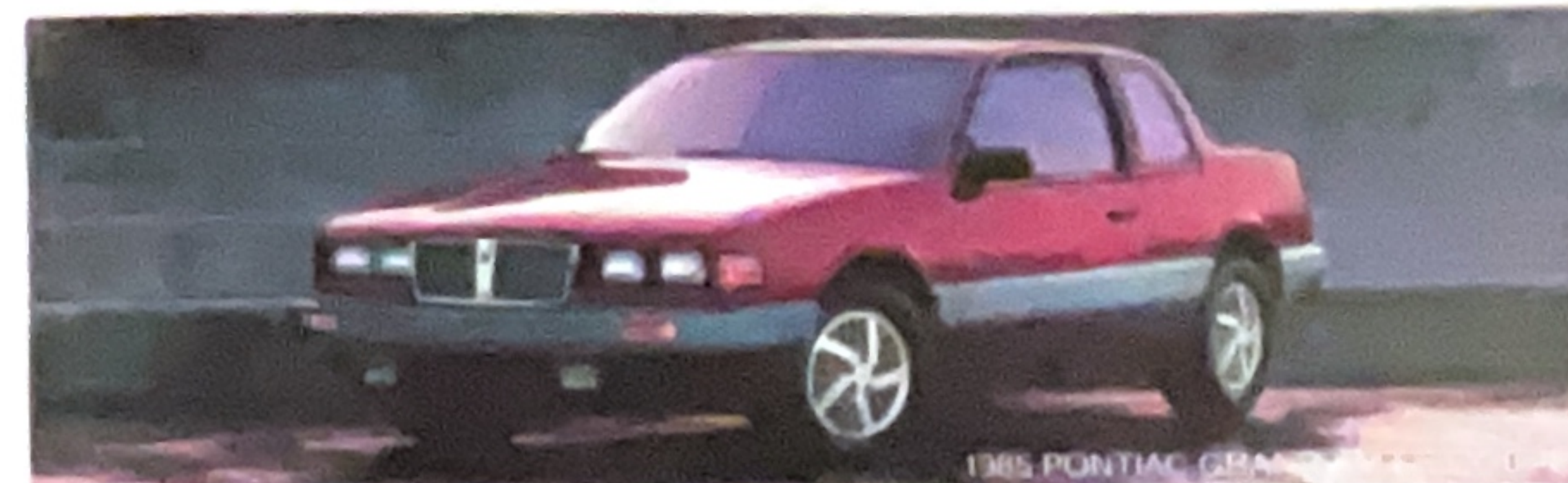
1985 PONTIAC GRAND PRIX