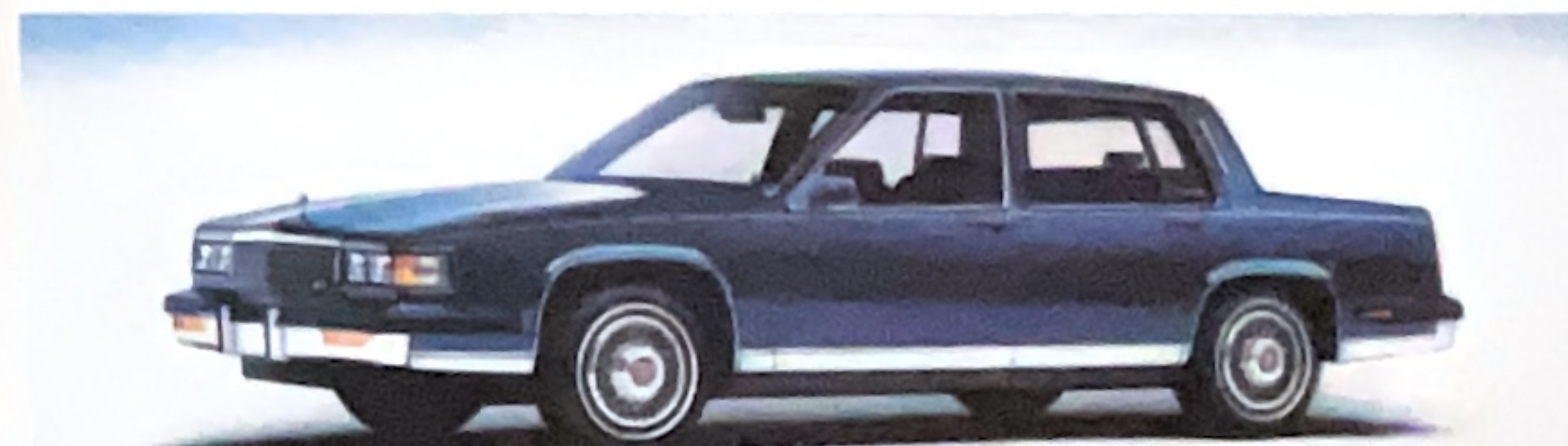
1985 CADILLAC FLEETWOOD SEDAN