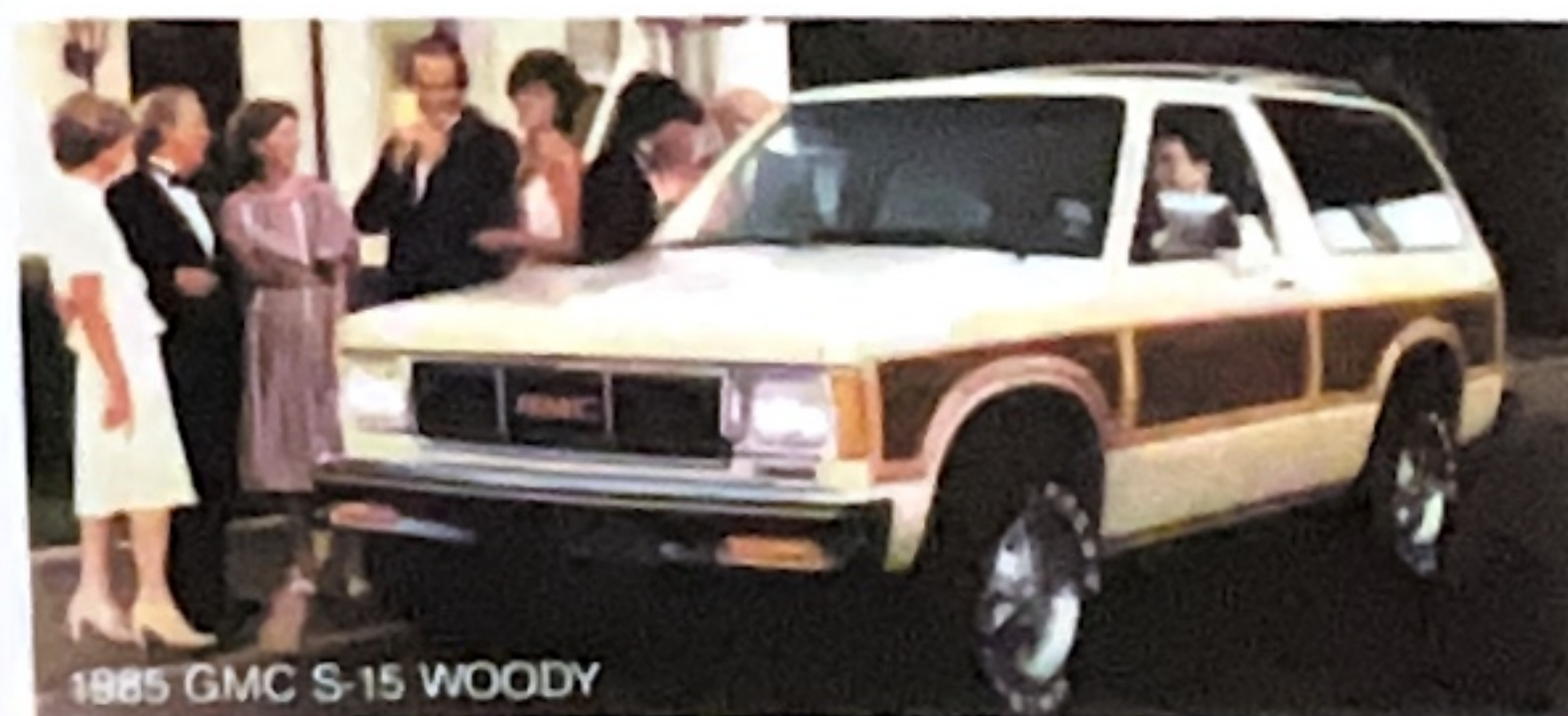
1985 GMC S-15 WOODY