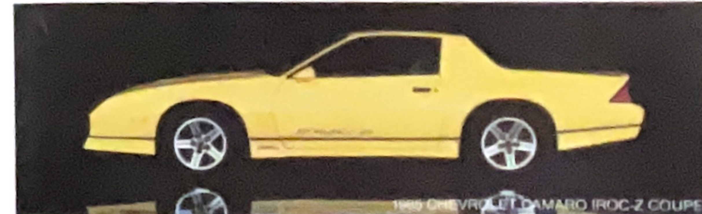
1985 CHEVROLET CAMARO IROC-Z COUPE