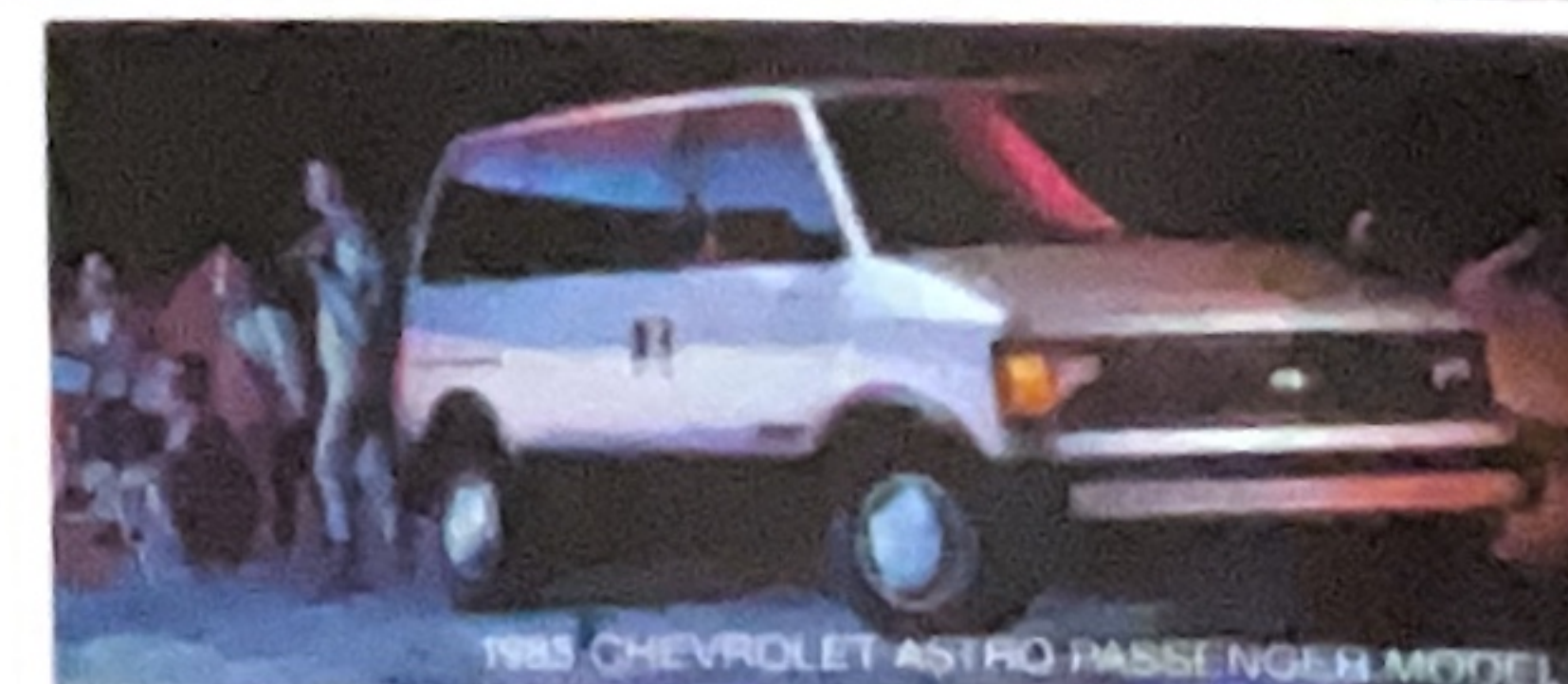
1985 CHEVROLET ASTRO PASSENGER MODEL