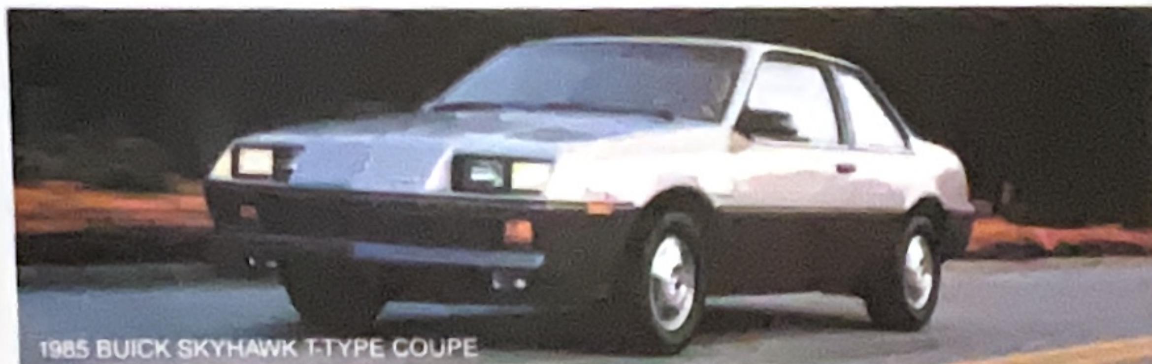
1985 BUICK SKYHAWK T-TYPE COUPE

Your visit to the General Motors World of Motion means you appreciate the role of high technology in automotive design. We invite you to see and feel our technology at work with a test drive at your favorite GM dealership soon!